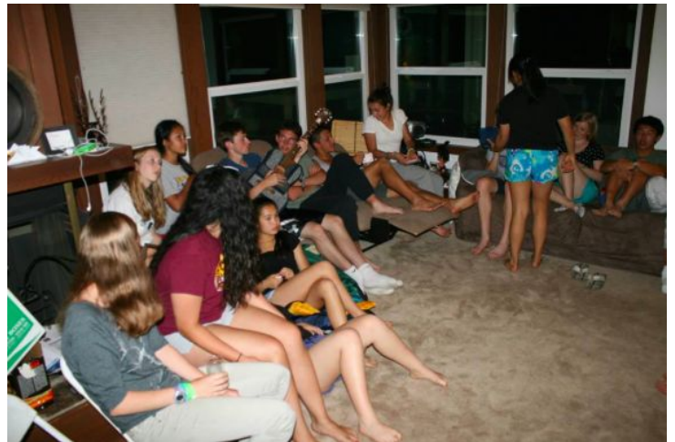
Members at the 2014-2015 elections