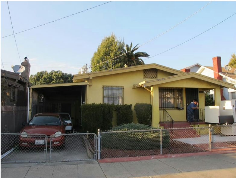
Above: Workplace for this April's RTO project